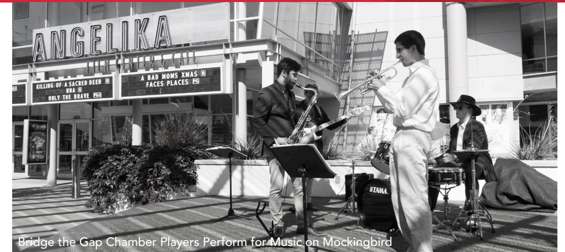
Bridge the Gap Chamber Players Perform for Music on Mockingbird

(Children's Medical Center) 866-682-6280 – answered 24/7 Free telephone advice covering questions about fever, coughing, vomiting, asthma, minor accidents, medication dosages and referrals to a doctor.